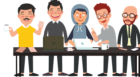
Public Providers Business Angels Start-ups Project Partners Business Experts